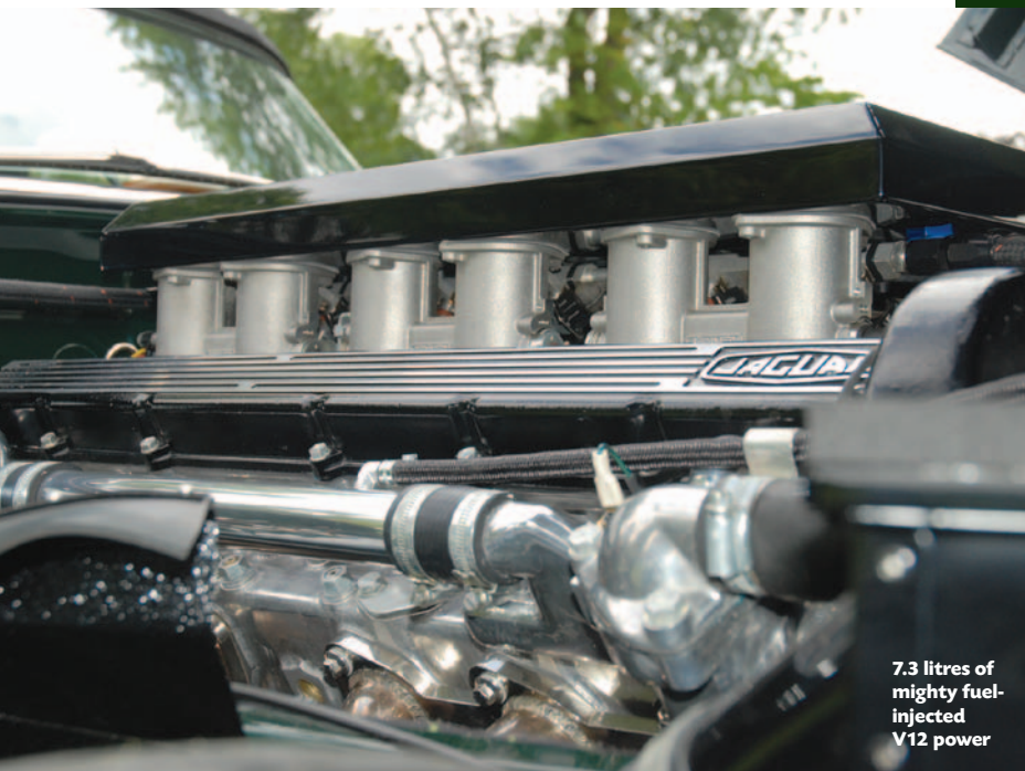
7.3 litres of mighty fuel-injected V12 power

his injuries and was physically in good shape. But he was left completely blind, unable to tell day from night. It was in rehab that he garnered hope from the conditions of other patients. In fact he was inspired and realised that as long as he had a good team around him, his head could compensate for his sight.