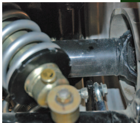
Drive shafts are now the size of prop-shafts to cope with the power