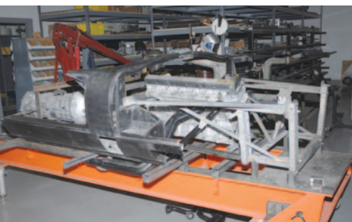
The next project – a 10-litre V12 driving through a Corvette transaxle wearing E-type 3 clothes

Its not all V12 E-type though, as customers often ask to have other cars in their collection looked after. This usually involves Jaguar and during our visit we saw a number of six-cylinder E-types, a range of XKs as well as an XJS and an XJ saloon. But perhaps the one that best caught this scribe's eye was a