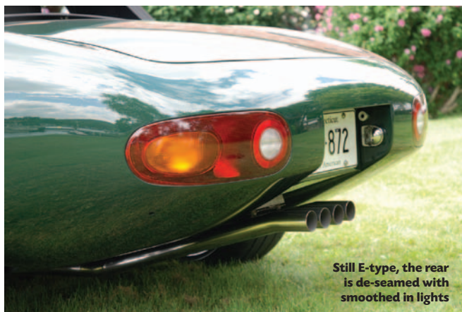
Still E-type, the rear is de-seamed with smoothed in lights

After walking around playing spot the upgrade, it's time to drive. I move from the outside caricature where the E-type concept has moved on, into the comfort zone that is the standard interior. Here I know everything