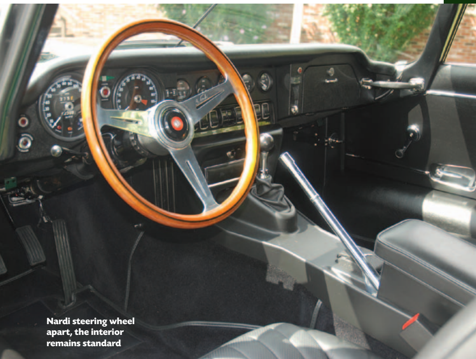
Nardi steering wheel apart, the interior remains standard