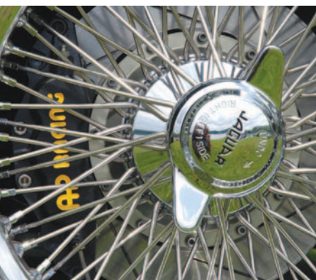
Specially commissioned Dayton wire wheels cover the AP Racing brakes